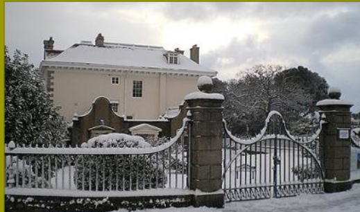
The Priaulx Library in the recent snow