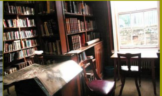
The interior of the Priaulx Library