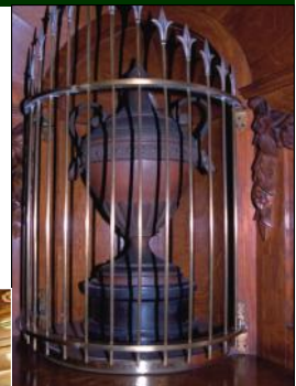
Urn containing Osmond Priaulx's ashes. This is on the ground floor of The Library

The first Guernsey Literary Festival will take place at various venues in Guernsey