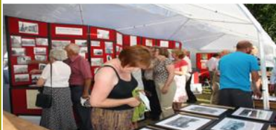
Friends at the Viera Marchi July 2010

Since its formation in 2005, the Friends of the Priaulx Library have supported the Library by: