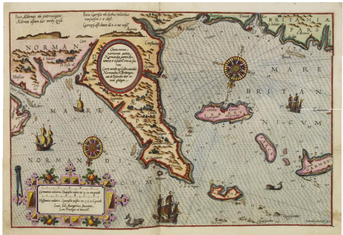
Fig. 1 Lucas Wagenaer 1588