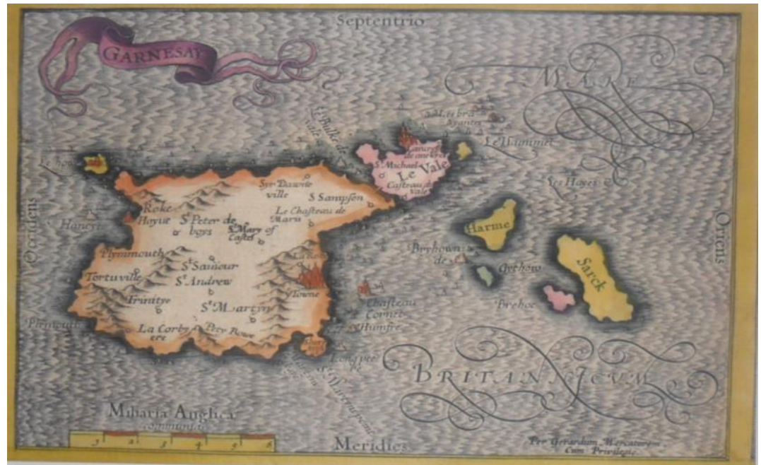
Fig. 2 Mercator 1595

Mercator published a map of Guernsey in 1595 that showed, for the first time, the location of the parish churches. The map (See Fig. 2) was in reality a detailed sketch of the Island but was unique in that it also showed and named several of the prominent offshore rocks.