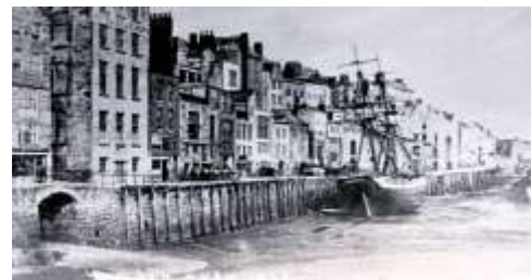
Quay and Cow Lane