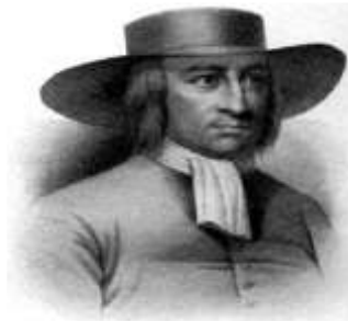
George Fox - Founder of the Quaker Movement

The name “Quaker” originated when founder George Fox told a Magistrate to “tremble (quake) at the name of God”.