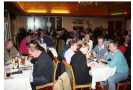
Quiz evening, February 2011