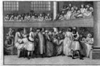
A woman preaches before an assembly of Quakers in London in 1723.

Sometime later they formed the nucleus of the Guernsey Quaker meetings. However, it was not until 1811 that the local Quakers had sufficient funds to build their own Meeting House at Clifton.