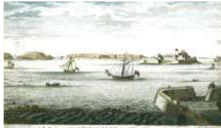
18th Century view from Candie