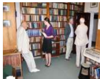
Staff and Friends at the Library

The Library staff can also arrange book signing events for local authors and lecture evenings.